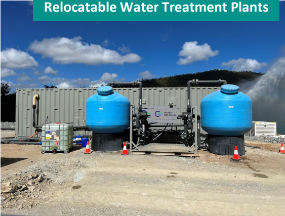
Relocatable Water Treatment Plants